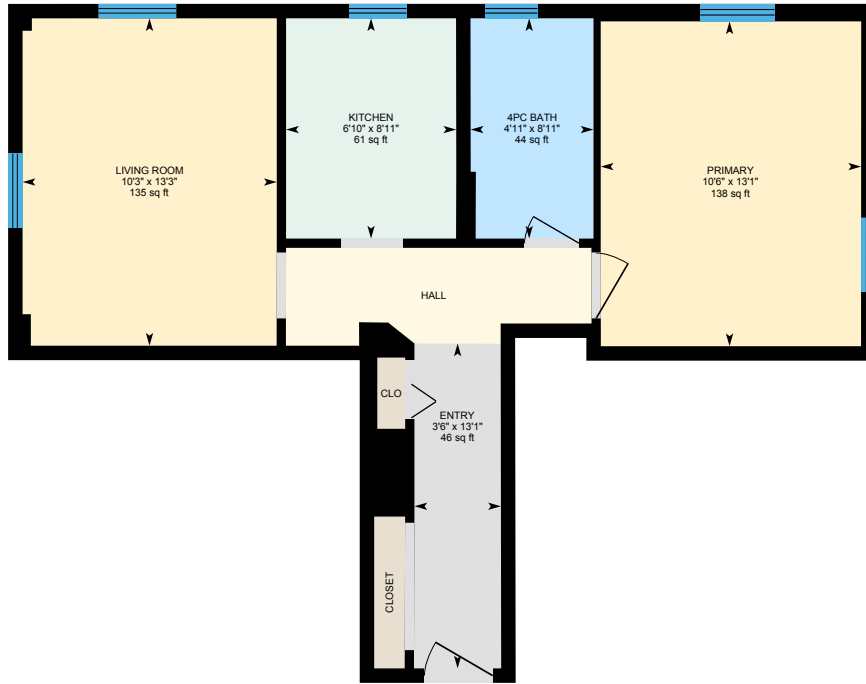
Main Floor Interior Area 507.59 sq ft