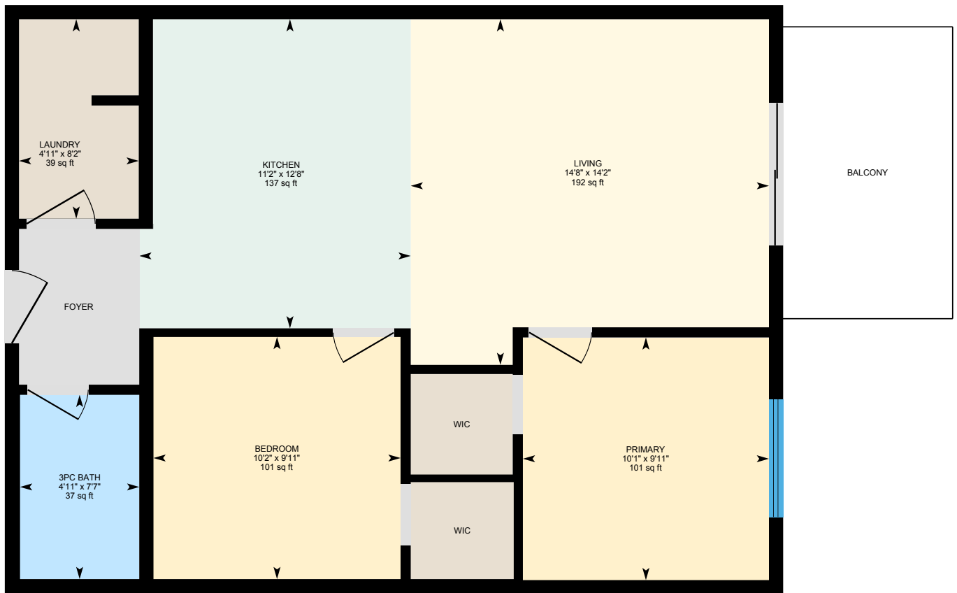
Main Floor Interior Area 707.67 sq ft