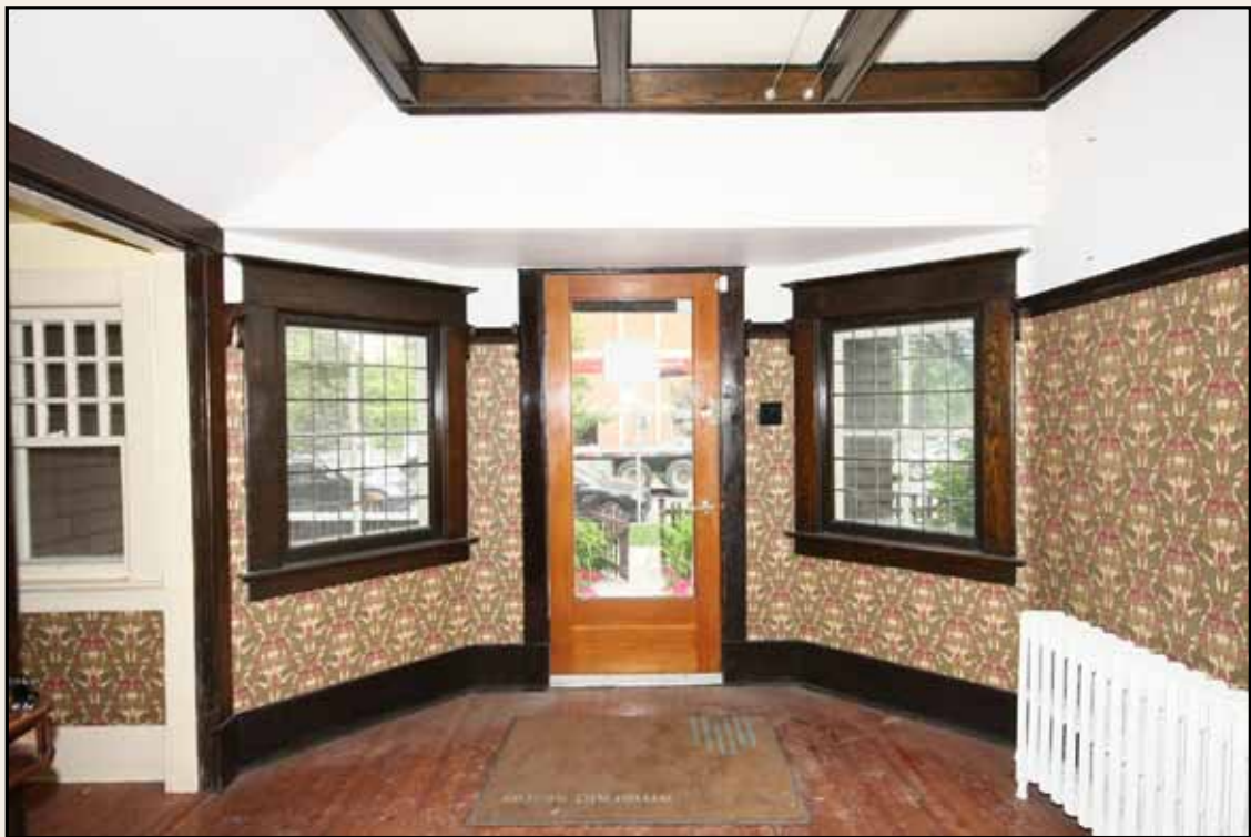
One of three entrances to the home. This foyer provides access to 15 Avenue SW.