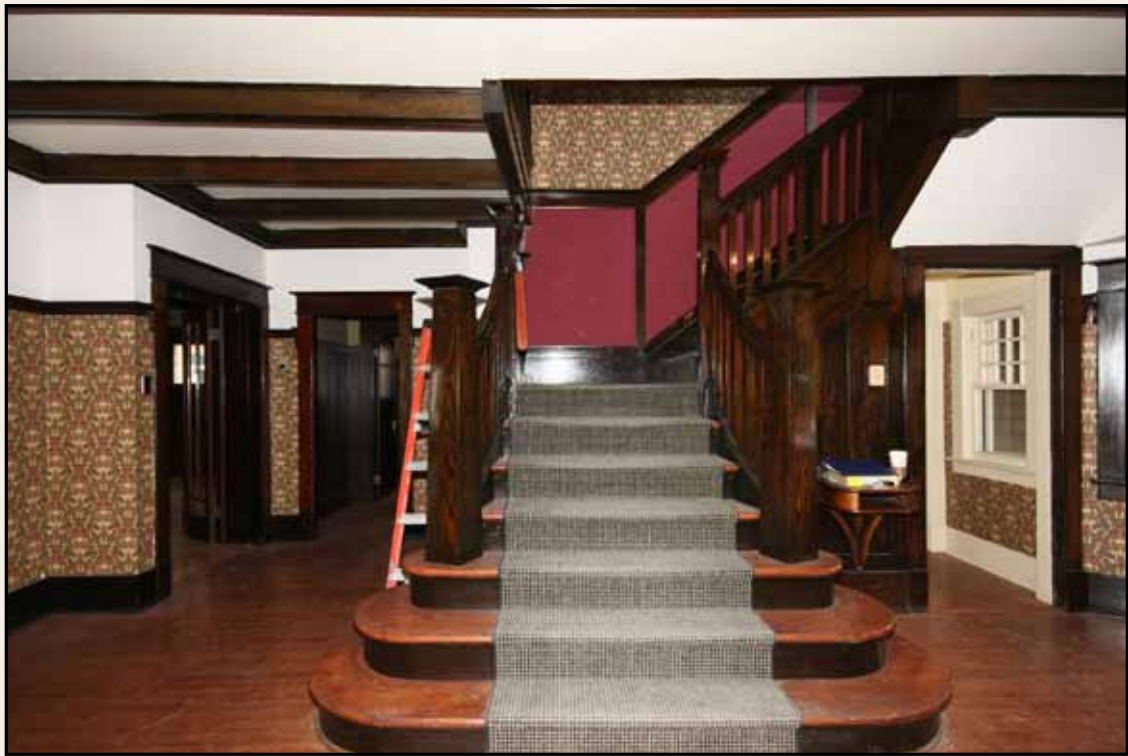
The dark stained woodwork and central staircase with newel posts showcases the Victorian charm of this historic home.