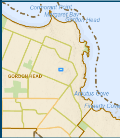
Property location within District of Saanich