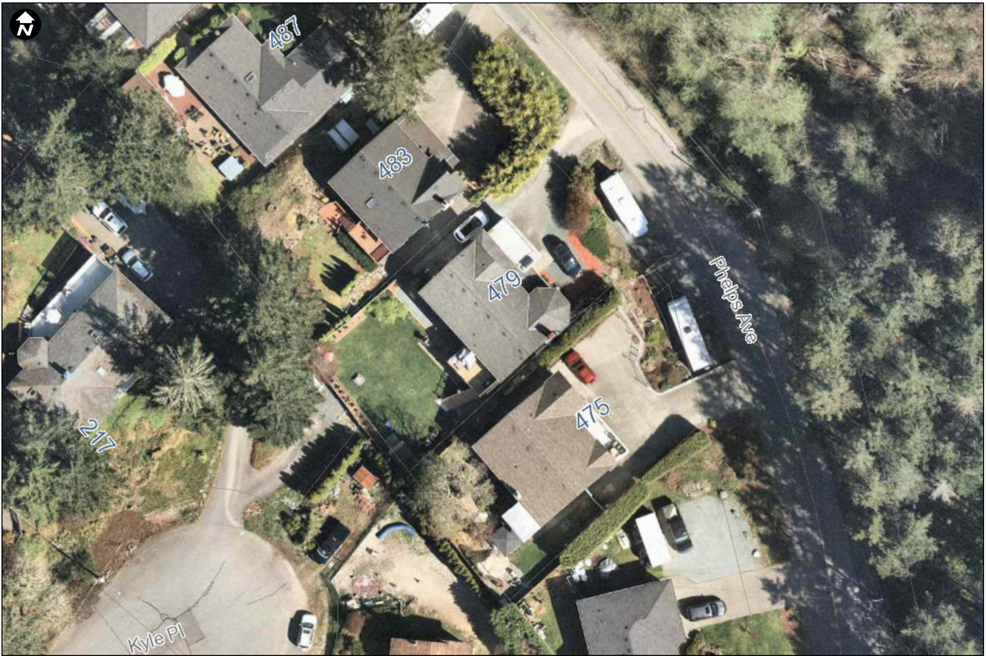
479 Phelps Aerial