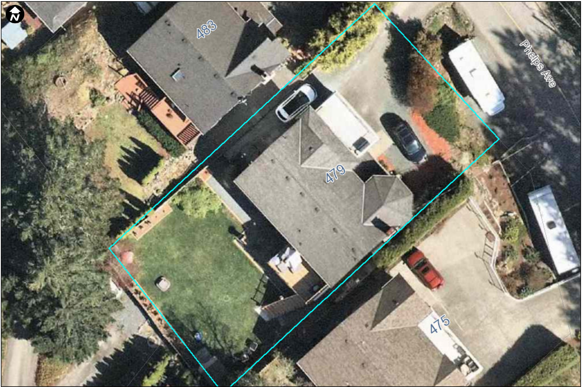
479 Phelps Aerial