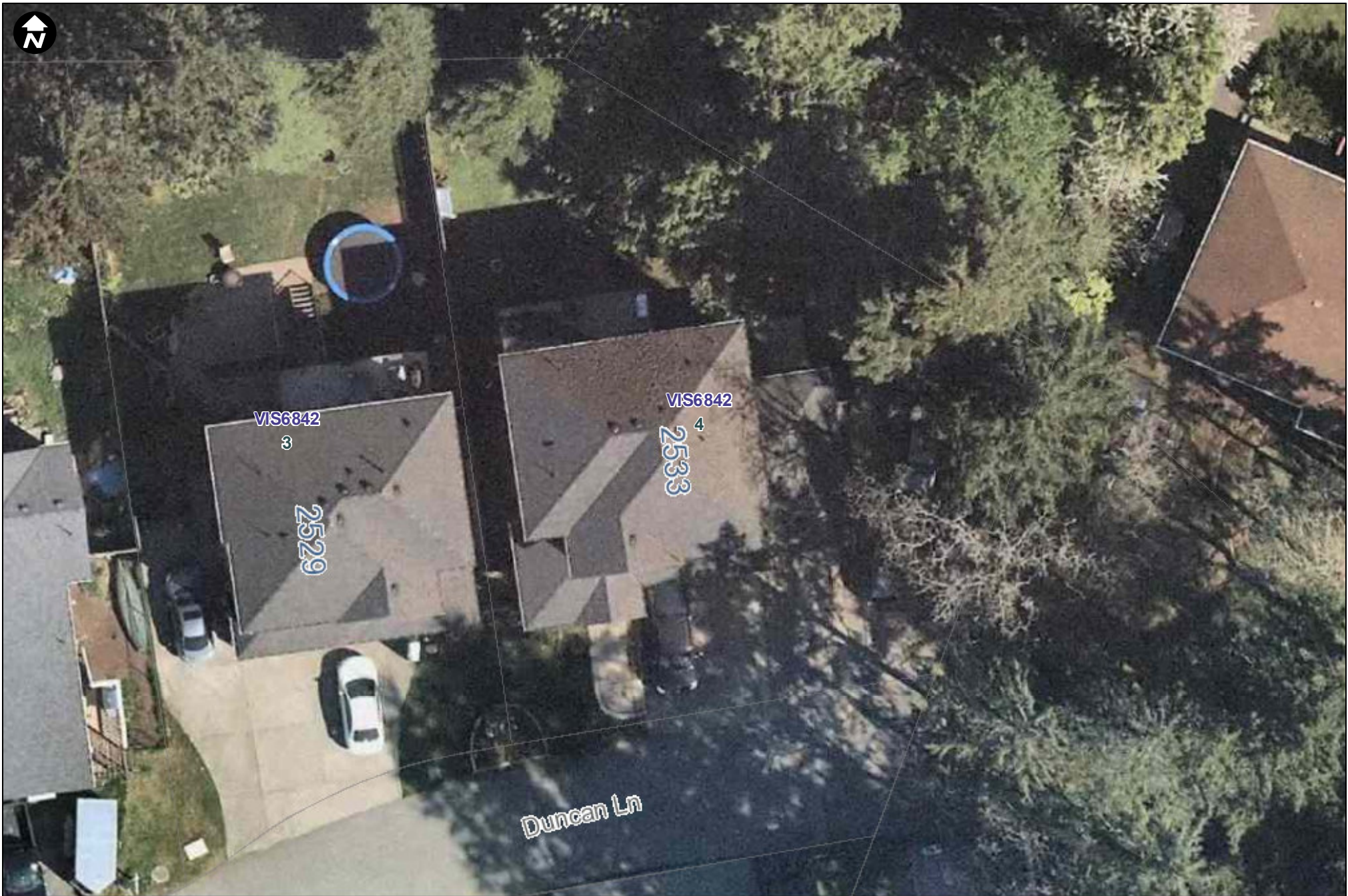
2533 Duncan Aerial Map