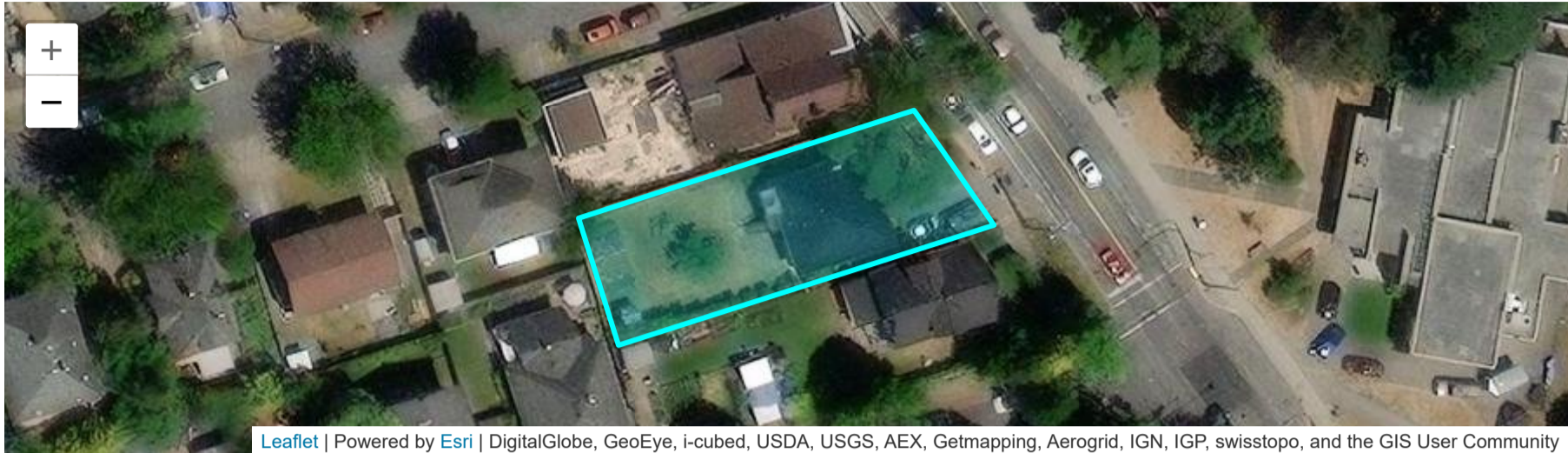
Leaflet | Powered by Esri | DigitalGlobe, GeoEye, i-cubed, USDA, USGS, AEX, Getmapping, Aerogrid, IGN, IGP, swisstopo, and the GIS User Community