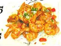
Prawns with Spicy Salt