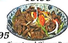
Signatured Ginger Beef