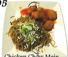
Chicken Chow Mein + Sweet & Sour Chicken Balls