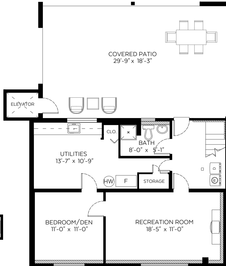
Lower Floor Plan Floor Area: 803 sq.ft. Ceiling Height: 7.5 ft.