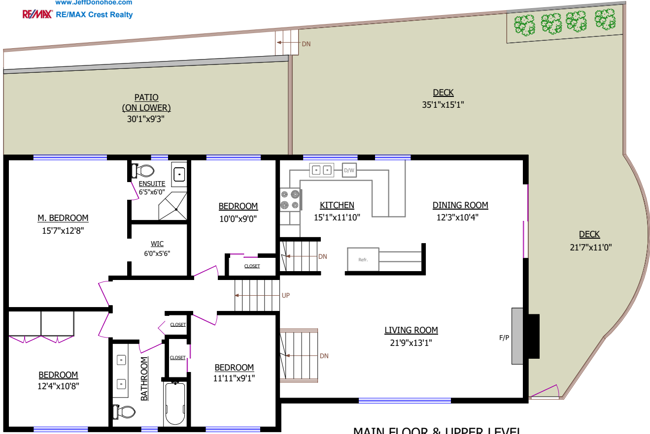
MAIN FLOOR & UPPER LEVEL