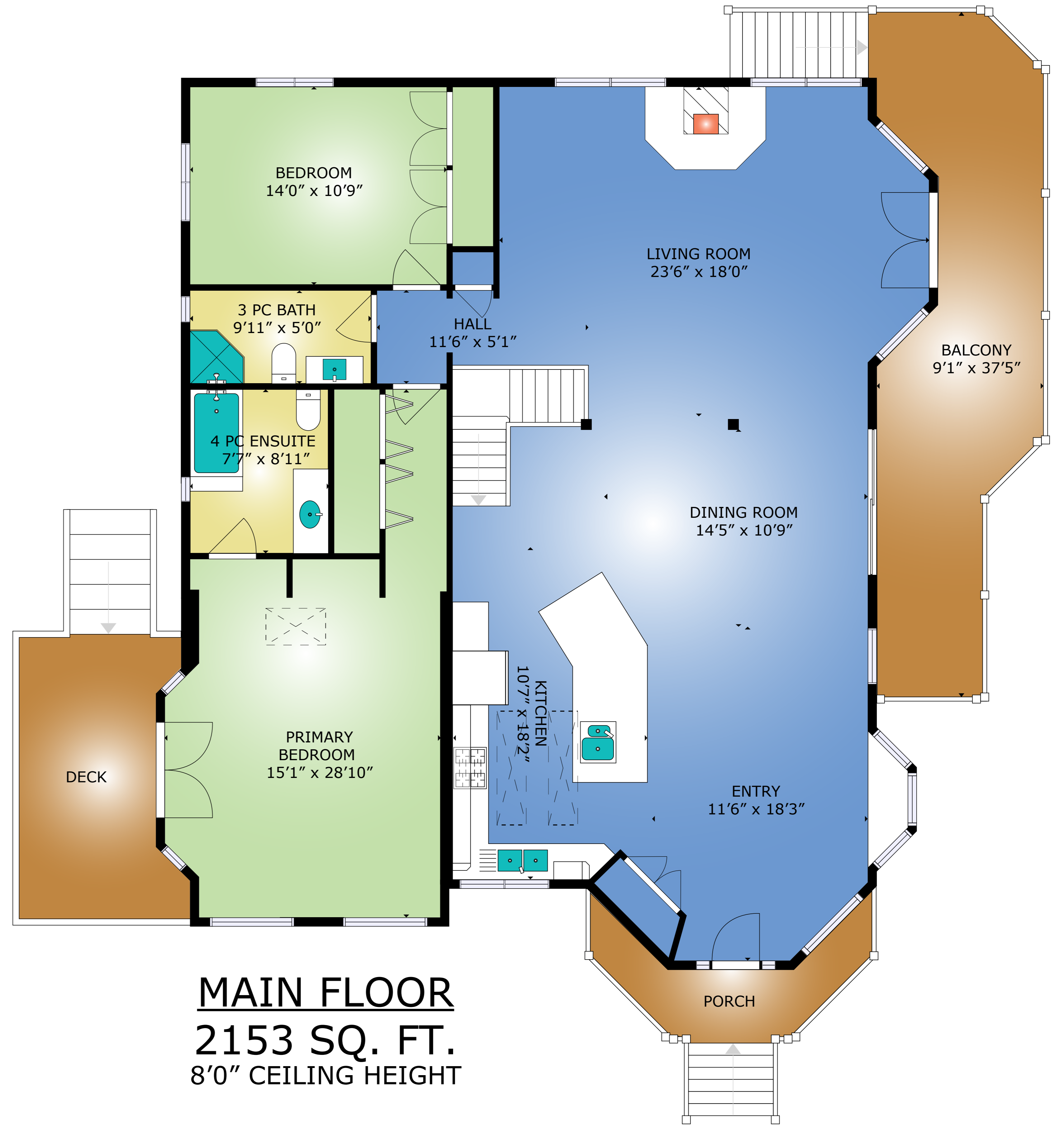
MAIN FLOOR 2153 SQ. FT. 8'0" CEILING HEIGHT