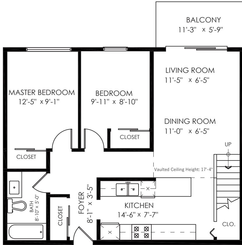
Main Floor: 774 Sq.Ft. Ceiling Height: 8'-0"