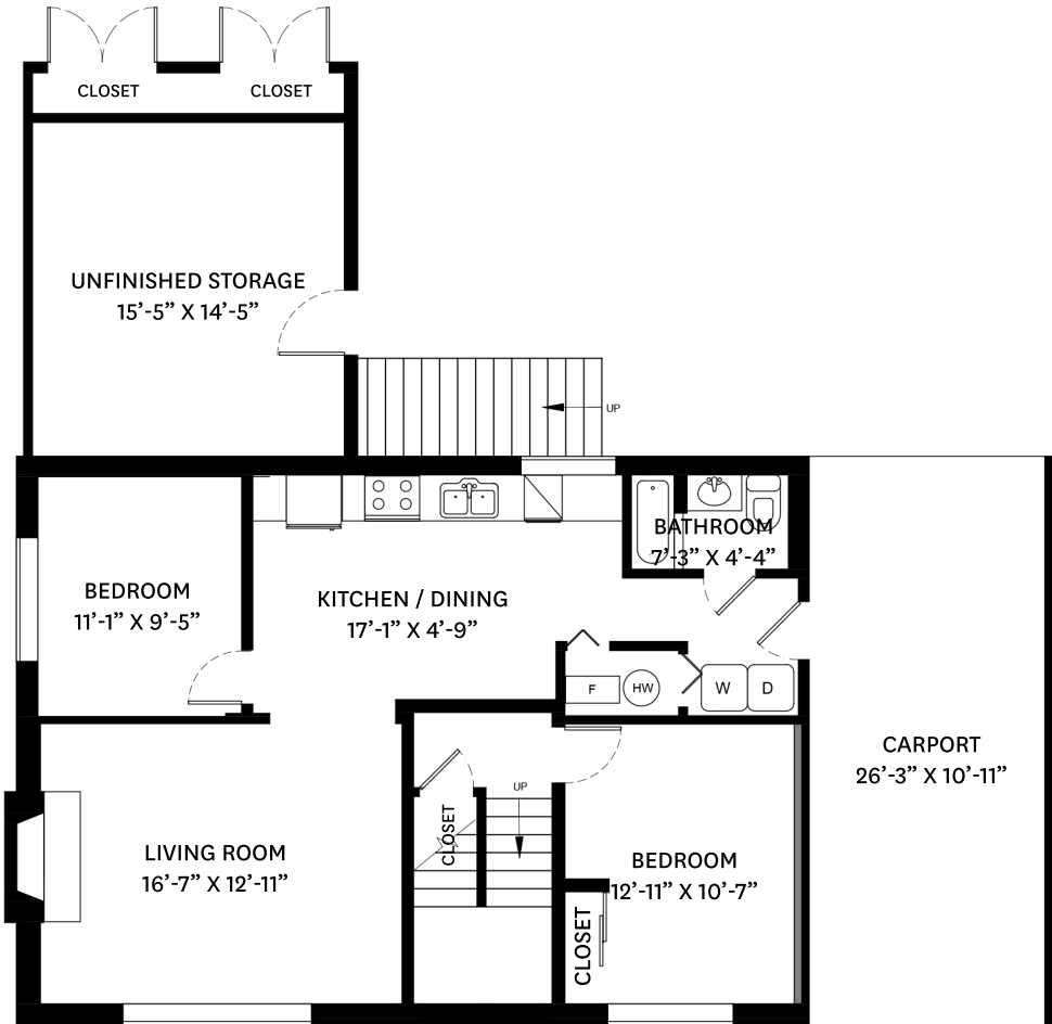
LOWER FLOOR PLAN Ceiling Height: 7'-8"

LOWER FLOOR TOTAL: 963 SQ.FT. UNFINISHED STORAGE: 281 SQ.FT. MAIN FLOOR TOTAL: 1,283 SQ.FT. PATIO: 279 SQ.FT. TOTAL: 2,246 SQ.FT. CARPORT: 304 SQ.FT.