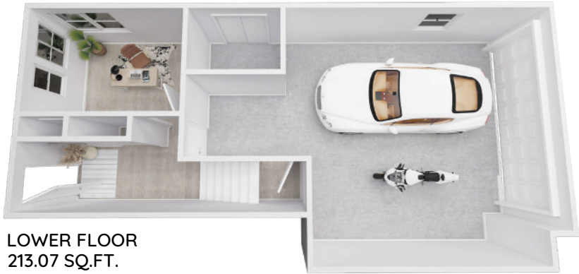
LOWER FLOOR 213.07 SQ.FT.