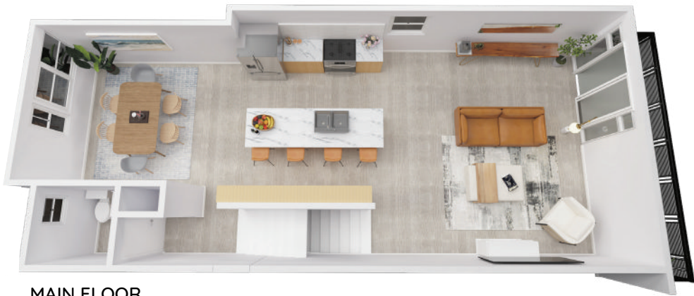
MAIN FLOOR 683.40 SQ.FT.