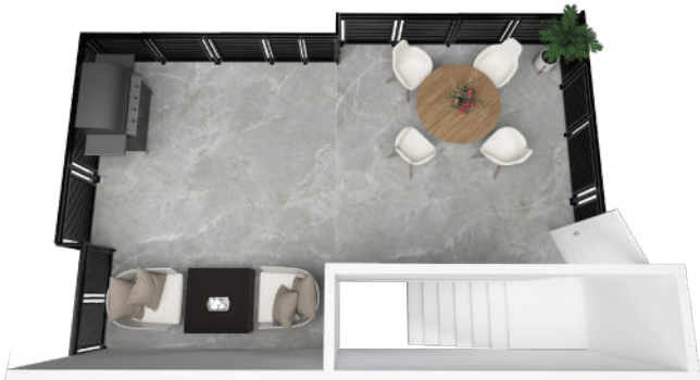
ROOF TERRACE 16 SQ.FT.