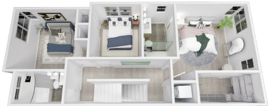
UPPER FLOOR 683.40 SQ.FT.