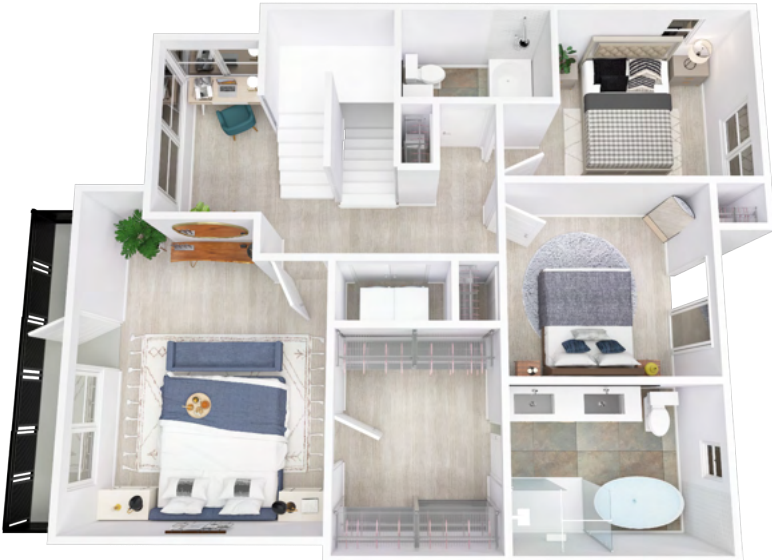
UPPER FLOOR 955 SQ.FT.