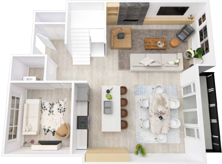
MAIN FLOOR 955 SQ.FT.