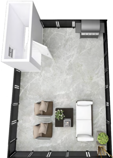
ROOF TERRACE (STAIRCASE) 16 SQ.FT.