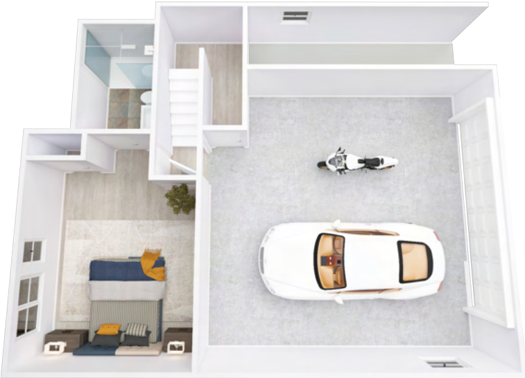
LOWER FLOOR 338 SQ.FT.