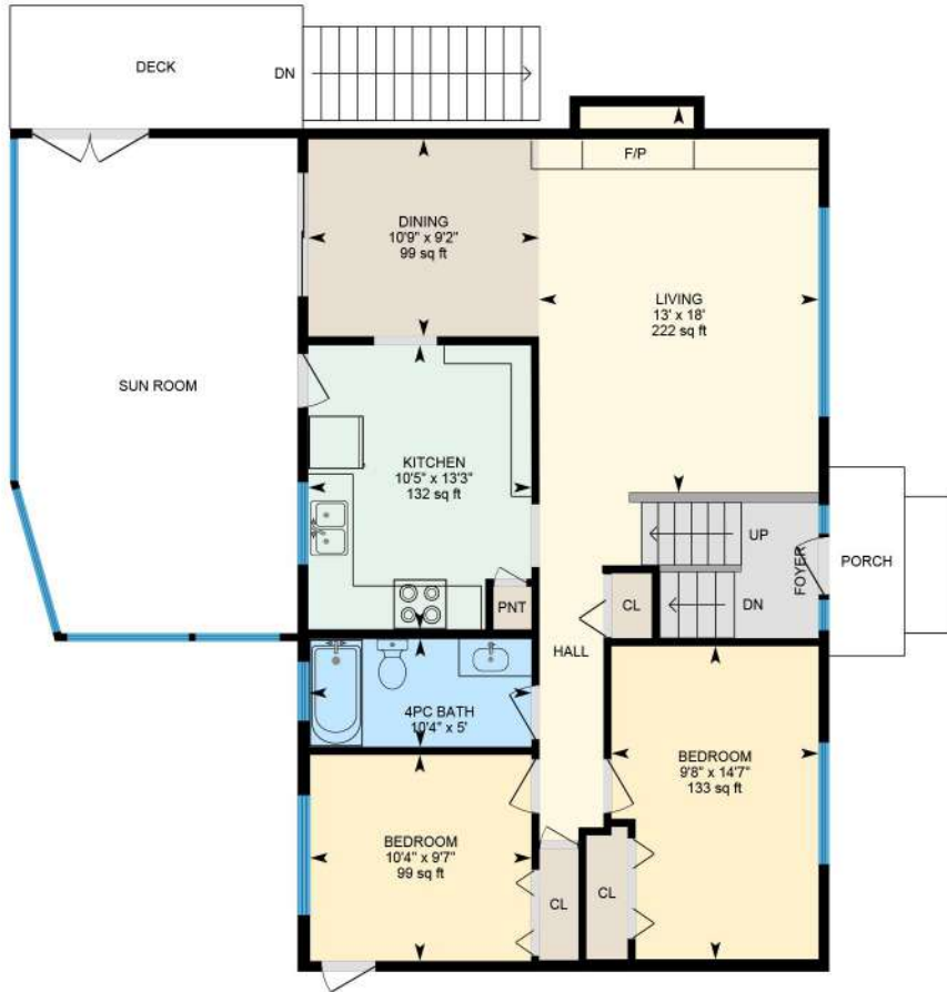
Main Floor Interior Area 927.70 sq ft

Main Building: Total Interior Area Above Grade 1445.39 sq ft