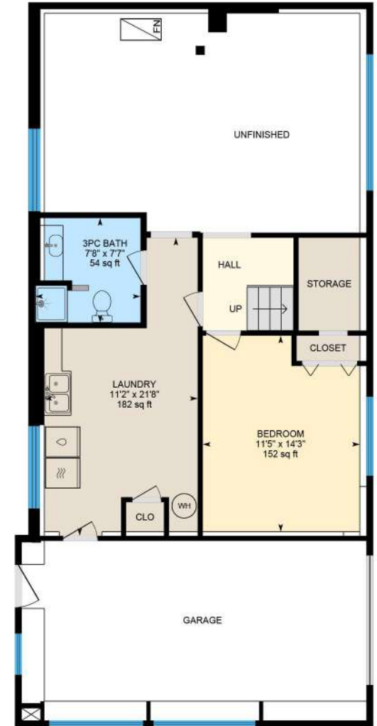
Basement Interior Area 517.70 sq ft