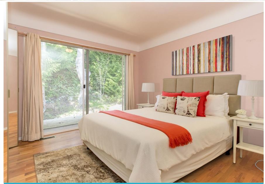
With eastern views towards the Salish sea and Mount Baker

1/4 acre property on the upper slope of Lochside drive with eastern views towards the Salish sea and Mount Baker. The large front yard is ready for your green thumb with mature plants including arbutus, cherry and "orange pippin" apple trees. Slider off the primary bedroom leads to a rear deck in the private, treed backyard. Some TLC required but the original 50's charm (coved ceilings, fireplace and oak hardwood floors) could be revitalized, or perhaps build new (and higher) to take advantage of a more commanding view? Excellent Cordova Bay location near beaches, McMinn park, Lochside Trail, and Claremont School. Assessed at $1.3m. 6'11 partially finished basement ready for your ideas. Single car garage. Natural gas furnace.