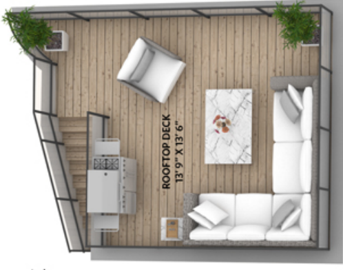
ROOFTOP DECK 230 SQ.FT.