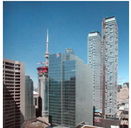
view from bedroom