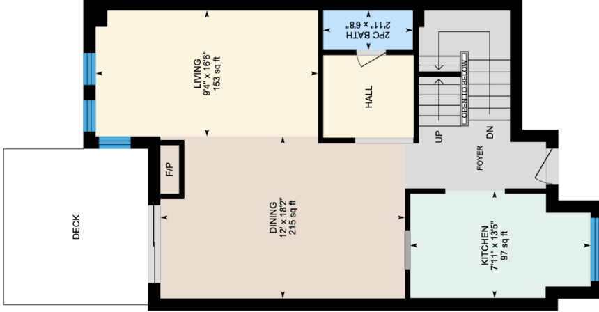
Main Floor Exterior Area 756.67 sq ft