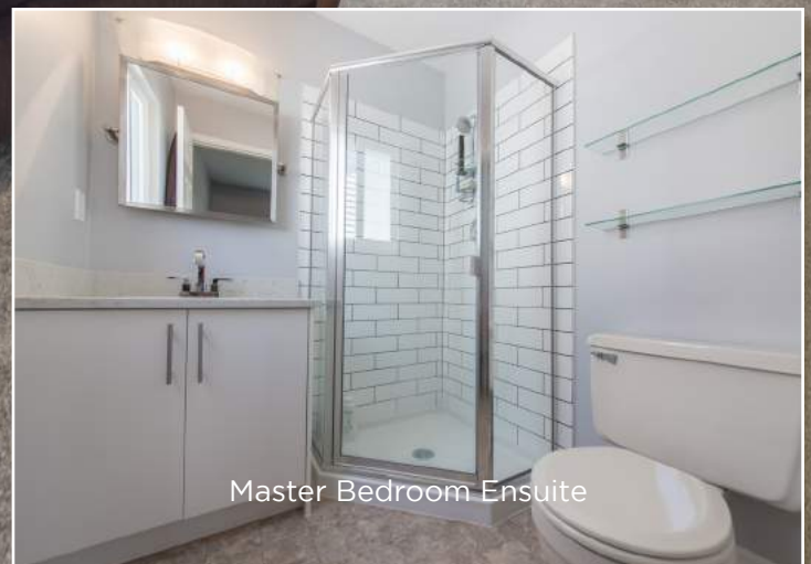
Master Bedroom Ensuite