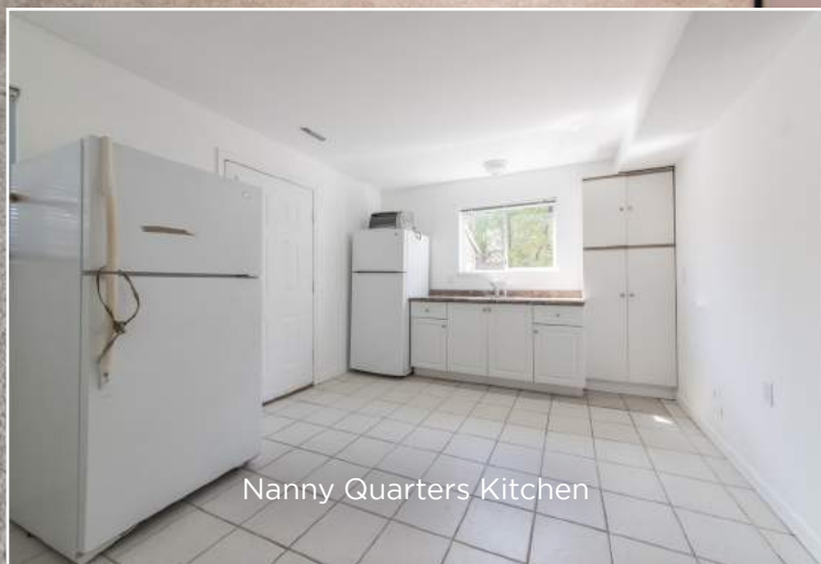
Nanny Quarters Kitchen

Down you'll find a bright above ground nanny's quarters with separate entrance - no stairs and a large rec room that can be kept for upstairs.