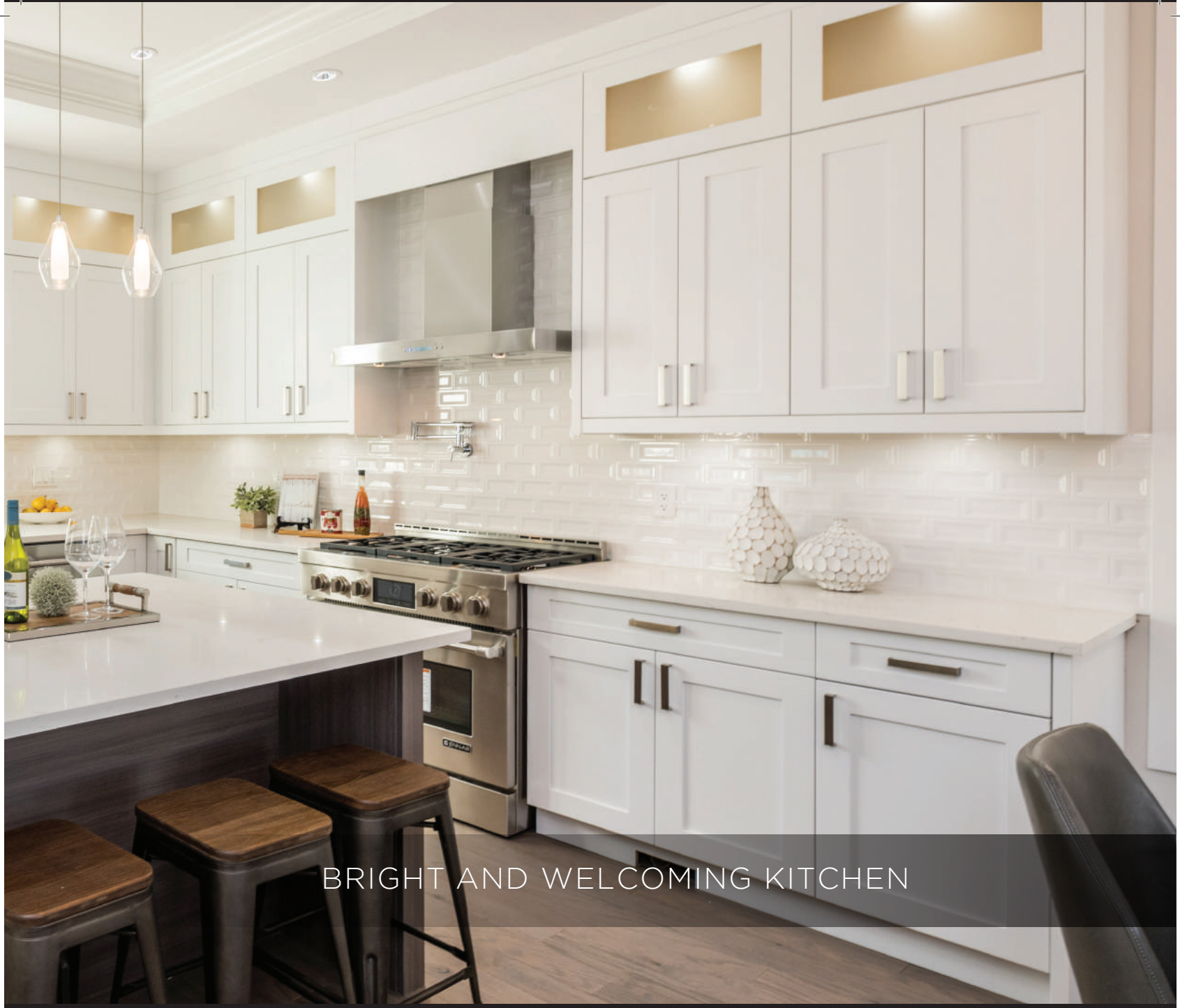
BRIGHT AND WELCOMING KITCHEN