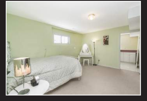
Beautifully finished basement with a family room, game room, hobby room, bedroom and full bath.