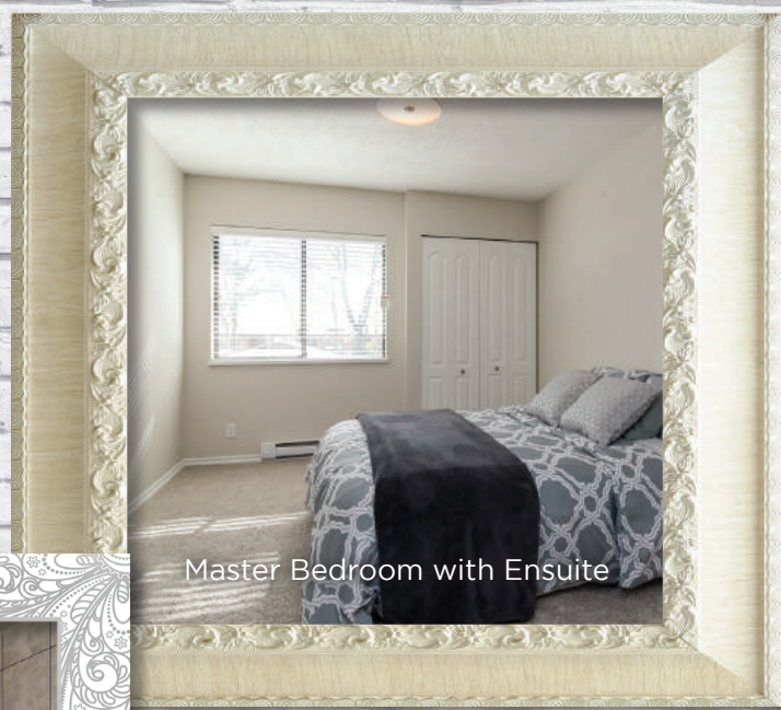
Master Bedroom with Ensuite