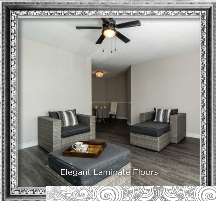
Elegant Laminate Floors