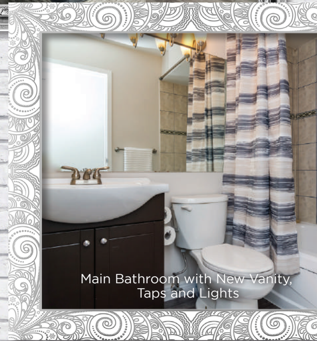
Main Bathroom with New Vanity, Taps and Lights