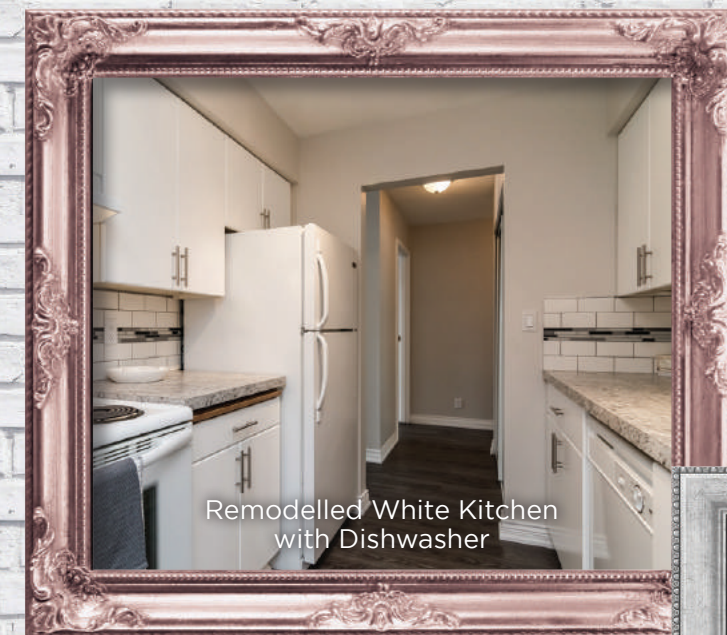
Remodelled White Kitchen with Dishwasher