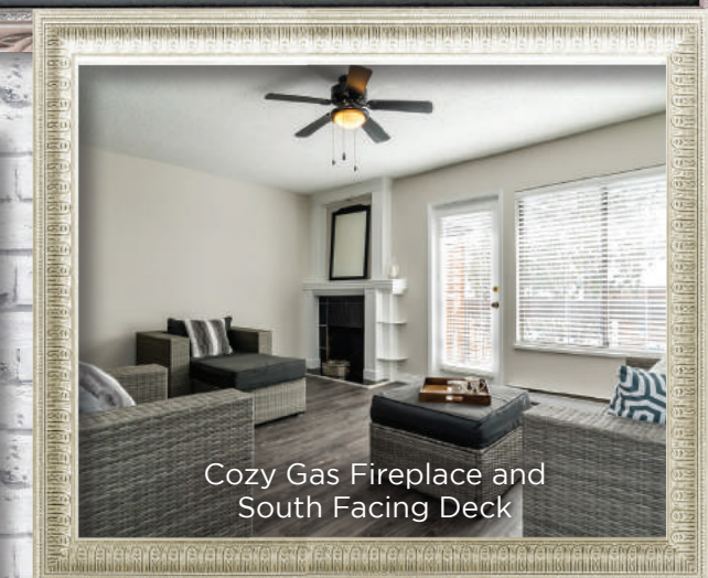
Cozy Gas Fireplace and South Facing Deck