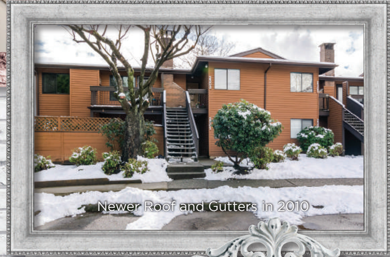
Newer Roof and Gutters in 2010