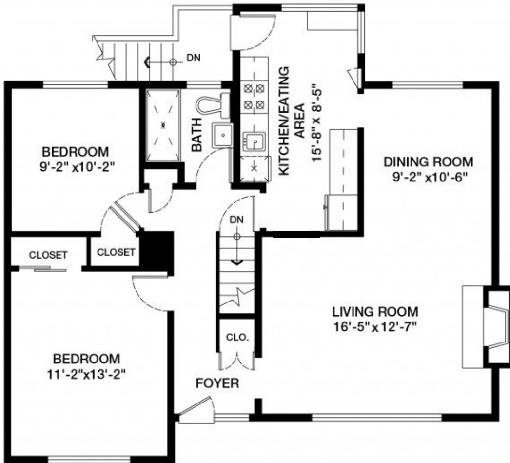
Main Floor Plan Floor Area: 937 sq.ft.