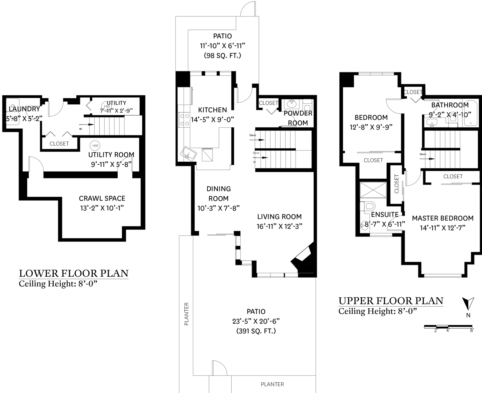
LOWER FLOOR PLAN Ceiling Height: 8'-0"

CRAWL SPACE: 195 SQ. FT. PATIO: 489 SQ. FT.