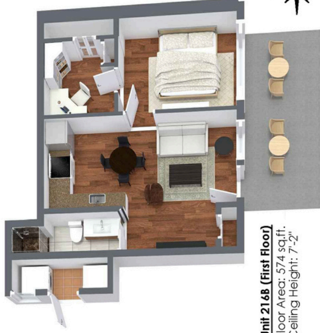
Unit 216B (First Floor) Floor Area: 574 sq.ft. Ceiling Height: 7'-2"