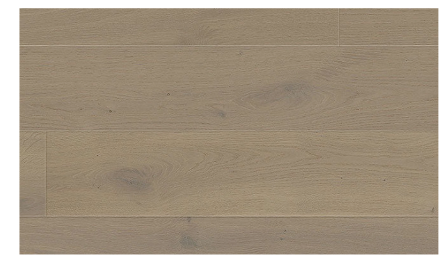
DESIGN ELEMENTS: WARM TONES | MOODY AESTHETIC | STORAGE