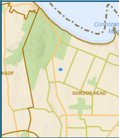
Property location within District of Saanich